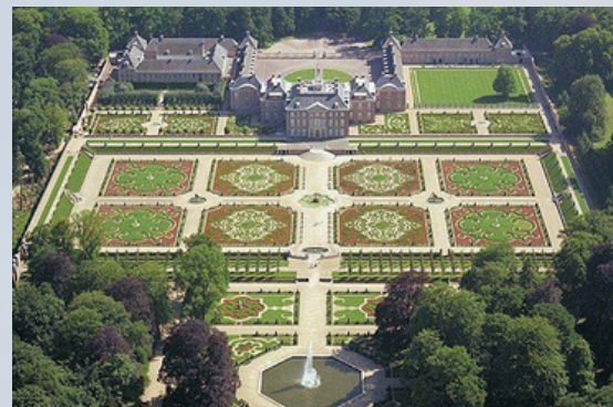
Royal Palace Het Loo, Apeldoorn