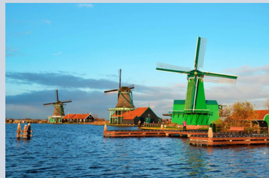
Zaanse Schans Windmill Farm