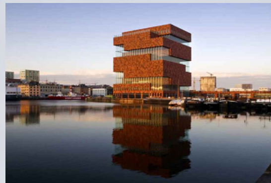
MAS Museum, Antwerp